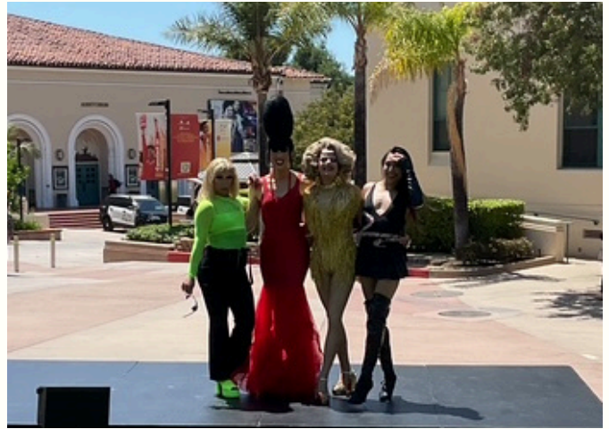
Pride Week 2025 Drag Show