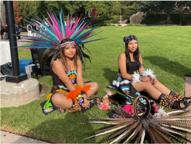
Dia De Los Muertos

In addition, in November of 2024, GCC's Board of Trustees passed resolution No. 16 , which solidified our Land Acknowledgement and our commitment to a collaborative allyship and partnership with the Gabrieleño/Tongva tribe. If you are interested in getting more involved or joining one of the planning committees, please check out our website.