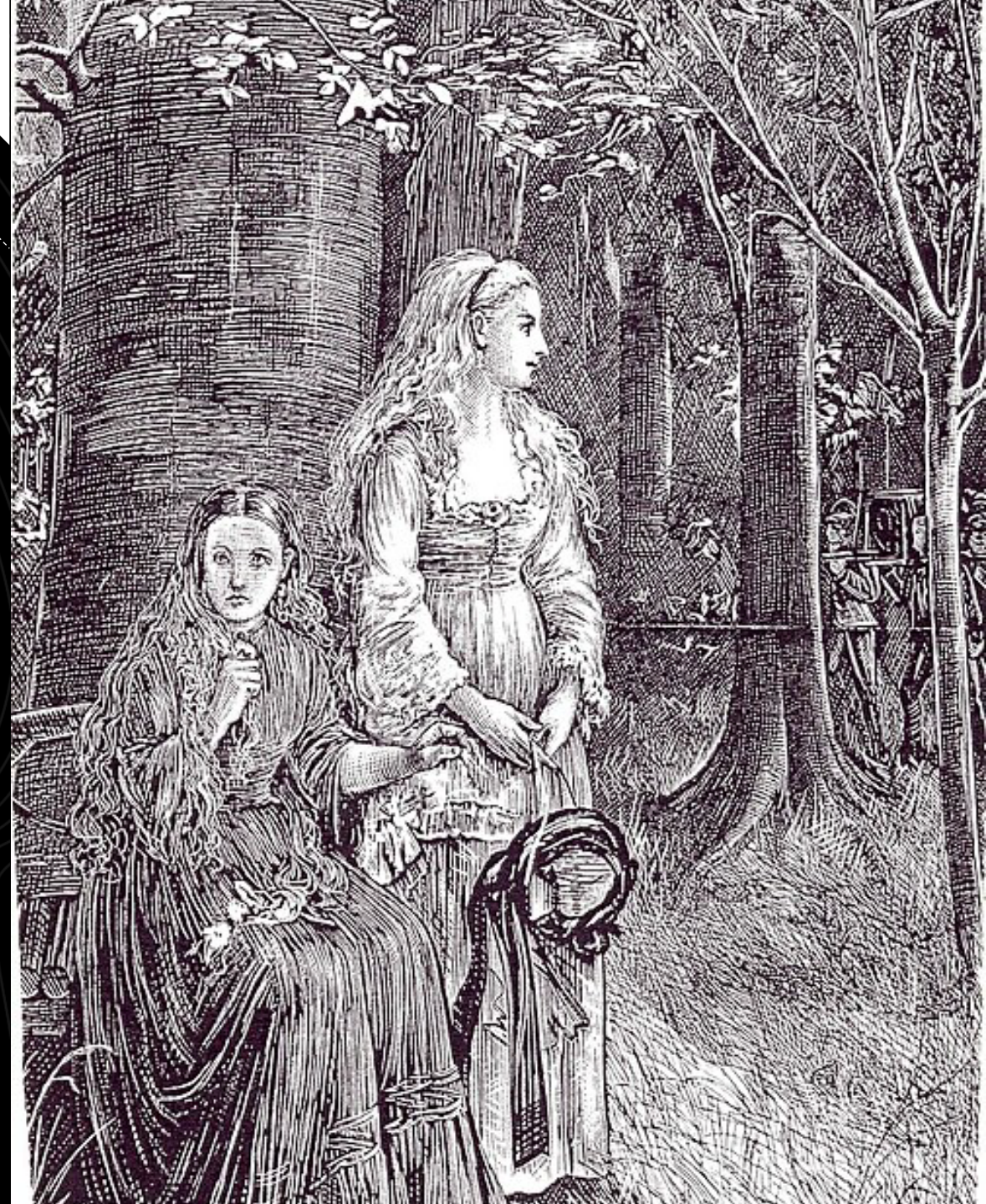
Image alt text: Illustration by Michael Fitzgerald for Carmilla (1872), electrotype after wood-engraving